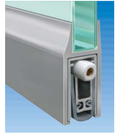
Planet KG-F10, fitted and pasted on