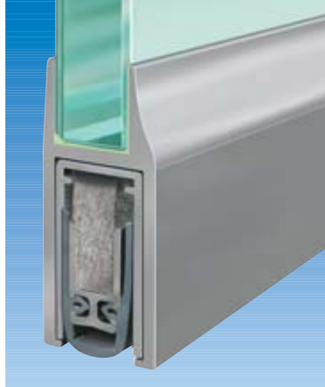
Planet KG-F10, fitted and pasted on