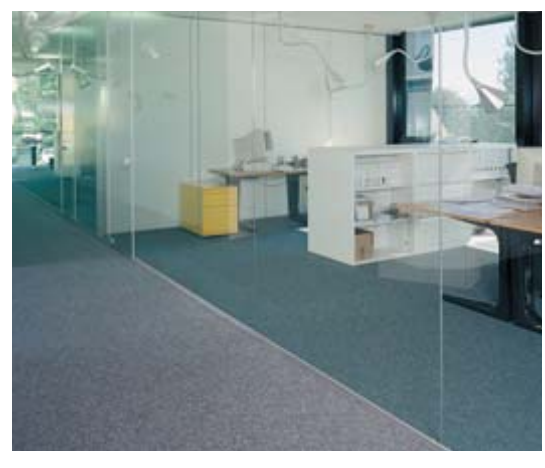
Assembly in all-glass doors and partitions