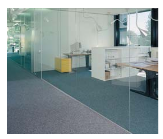
Assembly in all-glass doors and partitions