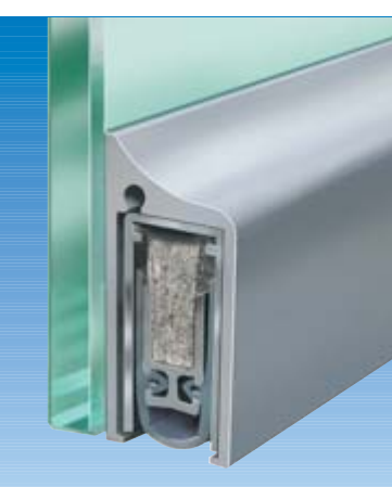
Planet KG-S, pasted laterally