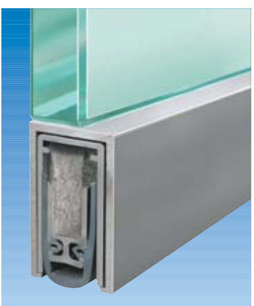
Planet KG-U, pasted from the bottom