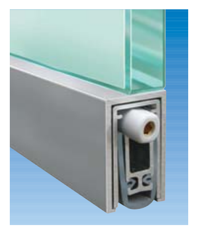
Planet KG-U, pasted from the bottom