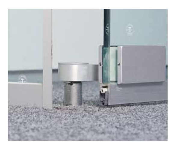
Planet KG-U hinge