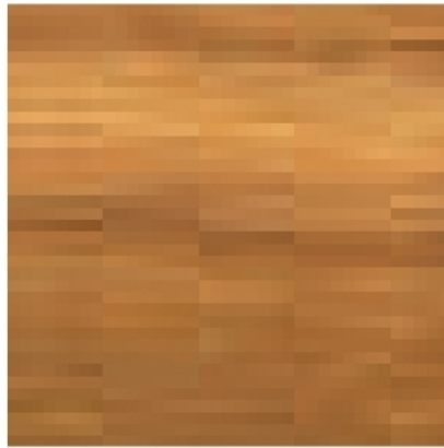
Eiche / chêne