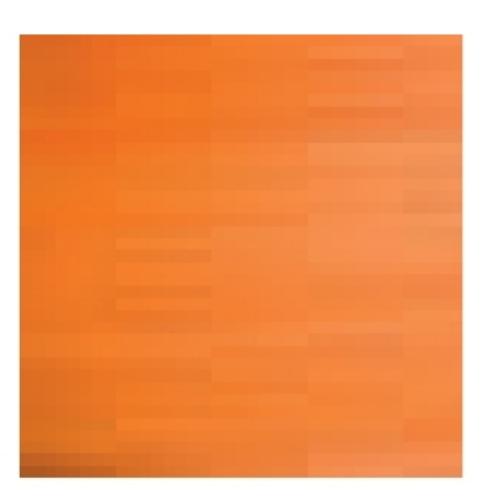
Buche / hêtre