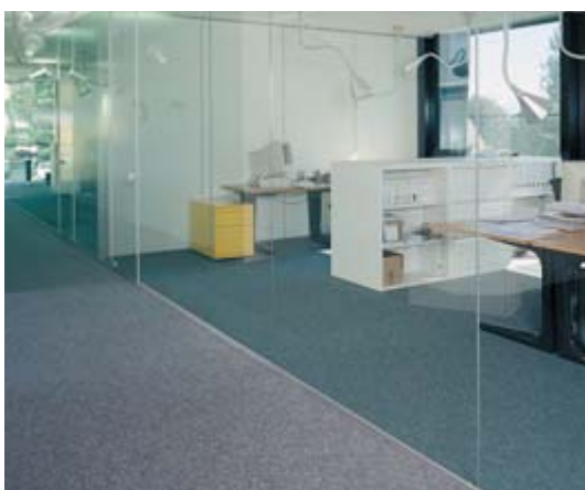
Assembly in all-glass doors and partitions