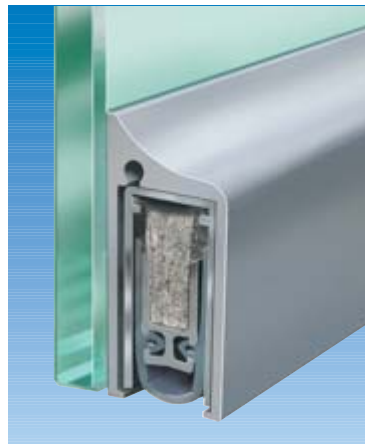
Planet KG-S, pasted laterally