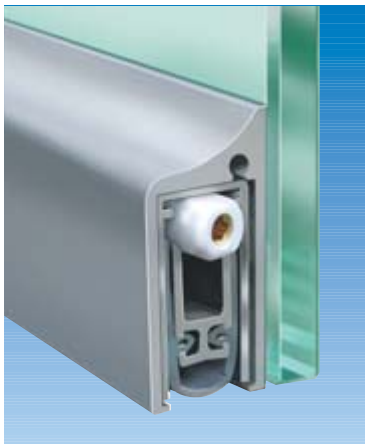
Planet KG-S, pasted laterally