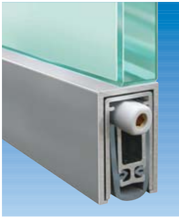
Planet KG-U, pasted from the bottom