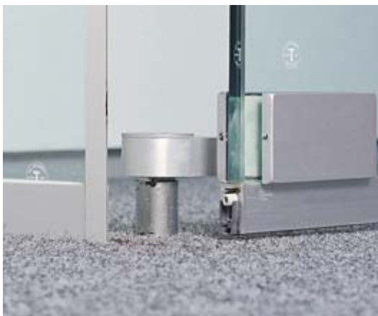
Planet KG-U hinge