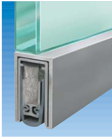
Planet KG-U, pasted from the bottom