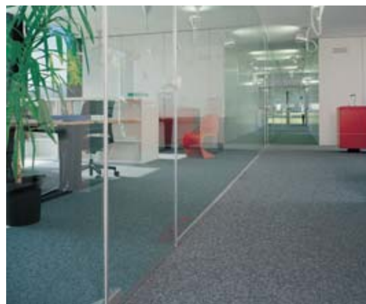
Planet KG-U application in an office building